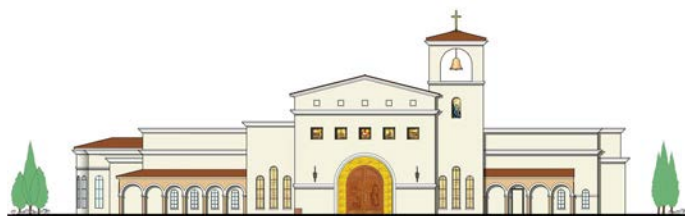
North Elevation (Entrance)

**Reflected in the Capital Campaign Total